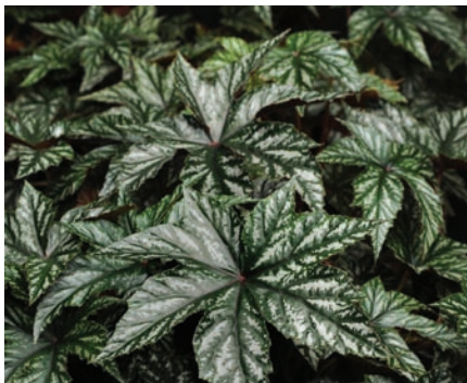
Begonia x hybrid Gryphon