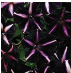
Petunia x hybrid Pinstripe

Phantom petunia shows off a black base colour with a distinctive yellow star pattern. It's the perfect, easy-to-grow petunia companion to Black Velvet at retail and in the garden. Phantom mounds with an upright habit, and works well in mixed container applications or on its own as a standout display. Ball FloraPlant