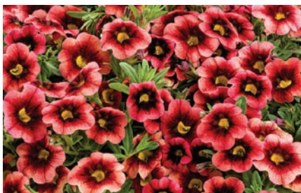
Calibrachoa Superbells® Coralberry Punch

The superb foliage of Gryphon begonia combines majestic beauty with strength and durability. This showy plant delivers a wow factor, and makes a dramatic garden statement in mixed or solo containers. Its unique tropical appearance is appealing, and home gardeners and designers will appreciate its versatility as both an outdoor shade or indoor lifestyle plant. PanAmerican Seed