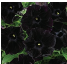
Petunia x hybrid Black Velvet

Petite and powerful, GoldDust mecardonia grows just 5-12 cm (2 to 5 in.) tall, and packs a punch with its sulfur yellow blooms from May through October. This feisty annual for full sun has excellent heat tolerance and delights all with a non-stop bloom show. Plant it in containers or in the landscape. It spreads slowly, creating a sunny carpet of colour. Proven Winners